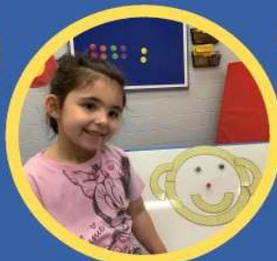
Visual Motor/Perceptual Skills