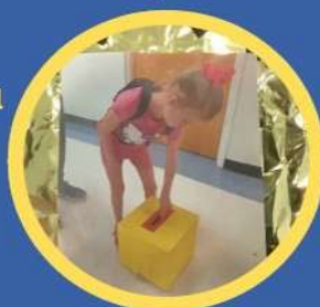
Fine Motor Skills

OTs: Provide direct treatment, Collaborate, Consult, Adapt equipment, and more!