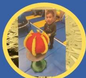
Gross Motor Skills

The Occupational Therapists at the Midland School support students to optimize their fullest potential at school, home, and in the community