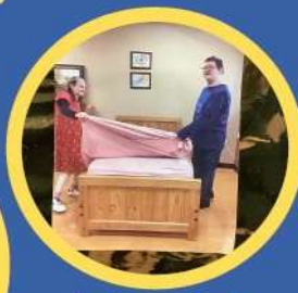
Independent Living Skills