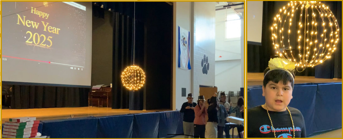
The ball dropped after the students counted from 10 to ring in the New Year! Students enjoyed wearing accessories, doing crafts, and having a pizza lunch!